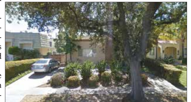
313 Foothill Road

Though previously reviewed on November 7, the commission directed ap-