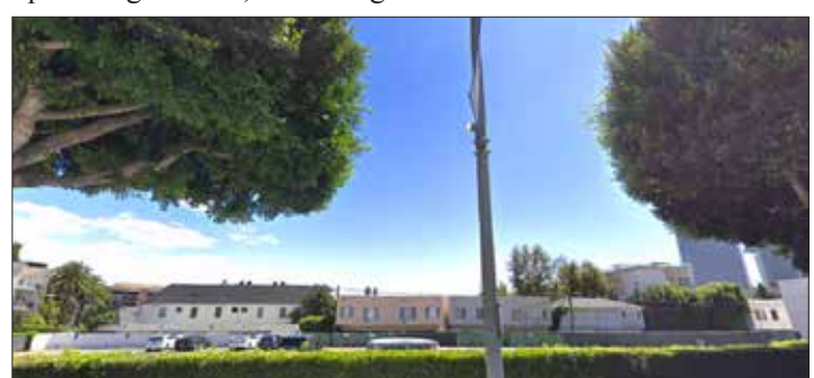
Friars Club Site

"The Peninsula is asking to delay this again and again. We've created a development agreement, we've negotiated with