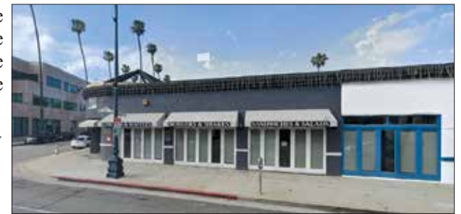
8633 Wilshire Boulevard

Goggles 8633, LLC, the project applicant, applied for a Development Plan Review to allow for the construction of a three-story building with rooftop use and a Minor Accommodation to allow it to improve the setback area on the property. Commissioners approved it with a 5-0 vote, with conditions which included