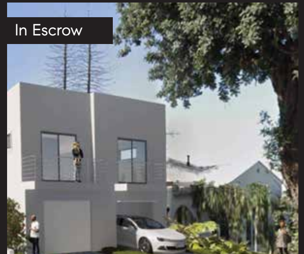
2419 S Cochran | Off Market

Compass is a licensed real estate broker and abides by Equal Housing Opportunity laws. All material presented herein is intended for informational purposes only. Information is compiled from sources deemed reliable but is subject to errors, omissions, changes in price, condition, sale, or withdraw without notice. No statement is made as to accuracy of any description. All measurements and square footages are approximate. Exact dimensions can be obtained by retaining the services of an architect or engineer. This is not intended to solicit property already listed. The buyer is advised to independently verify the accuracy of that information. Based on information from the Association of REALTORS®/Multiple Listing as of 02/26/2019 and/or other sources. Display of MLS data is deemed reliable but is not guaranteed accurate by the MLS. The Broker/Agent providing the information contained herein may or may not have been the Listing and/or Selling Agent. This is not intended as a solicitation if your property is currently listed with another broker. DRE 01866951