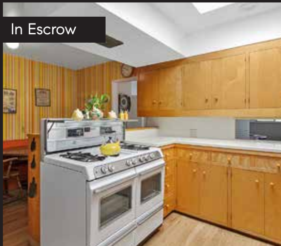
4267 Mentone Ave