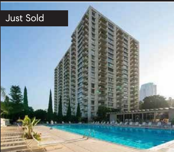
2170 Century Park East #1406