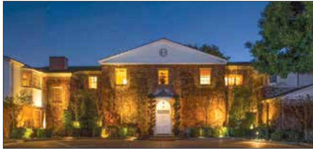
1050 Summit Drive

a HIP and a Tree Removal Permit for the home located on 1050 Summit Drive in its June 25 meeting.