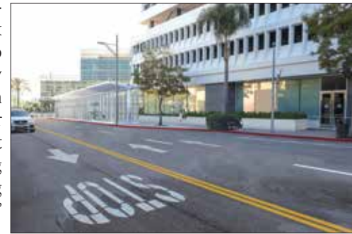
Canon Drive North Portal rendering

Councilmembers will decide on a portal location and certify a final EIR report either on October 27 or afterwards. According to a city staff report, the date of that decision is dependent on the number of public comments the city receives.