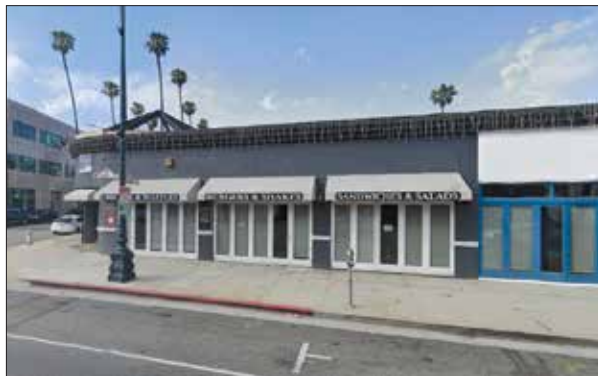
8633 Wilshire Boulevard

According to a city staff report, the building will have rooftop uses, subterra-