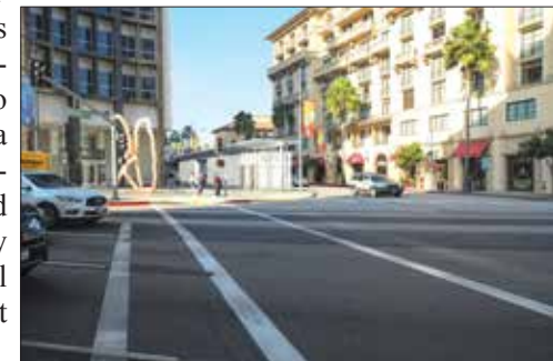
Beverly Drive North Portal rendering