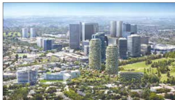
A rendering of One Beverly Hills

posed $2 billion condominium hotel-complex in Beverly Hills, is in the process of preparing a draft environmental impact report.