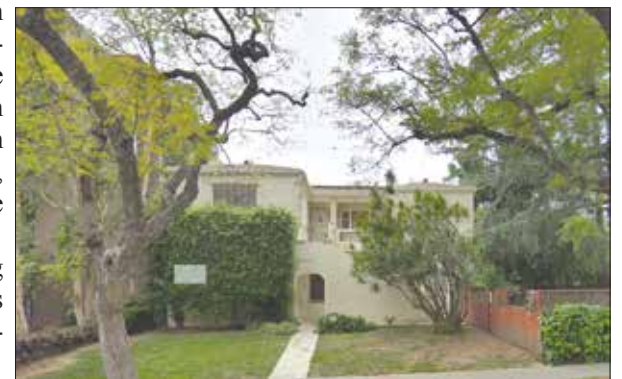
457 North Oakhurst Drive