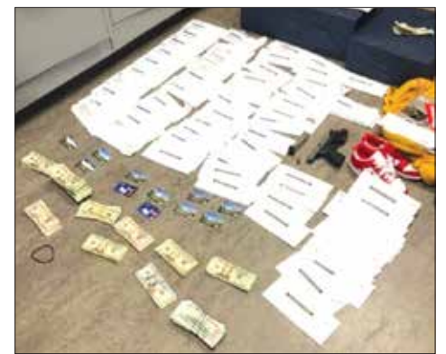
Confiscated items by Beverly Hills police officers

In response to this growing trend and the numerous arrests and seizures, the BHPD met today with local, State and Federal law enforcement agencies