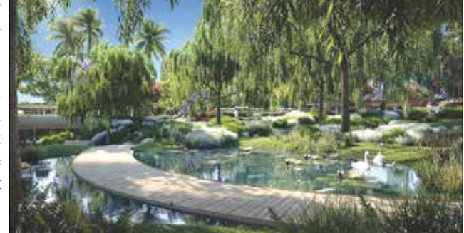
Wilshire Rendering of One Beverly Hills proposal and Santa

a proposed luxury hotel, condominium and botanical garden that would be located at the intersections of