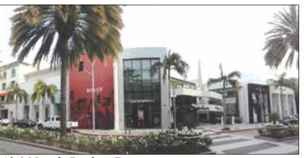
436 North Rodeo Drive

The Architectural Commission was scheduled to consider facade modifications to the Giorgio Armani store on North