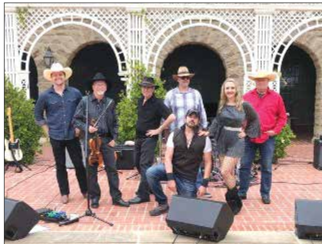
Country Nation recorded for the virtual Concerts on Canon series in June

Next Thursday, Country Nation comes to Beverly Gardens Park on Canon Dr with their high energy showcase playlist