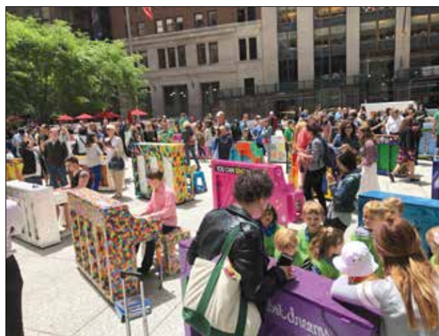
Sing for Hope Pianos debut at Fosun Plaza, NYC

actor and activist Monique Coleman is expected to receive the “All for Art” award that recognizes her work as a cultural animator, commitment to community and youth empowerment. Coleman was previously appointed as the United Nation’s first “Youth Champion.”