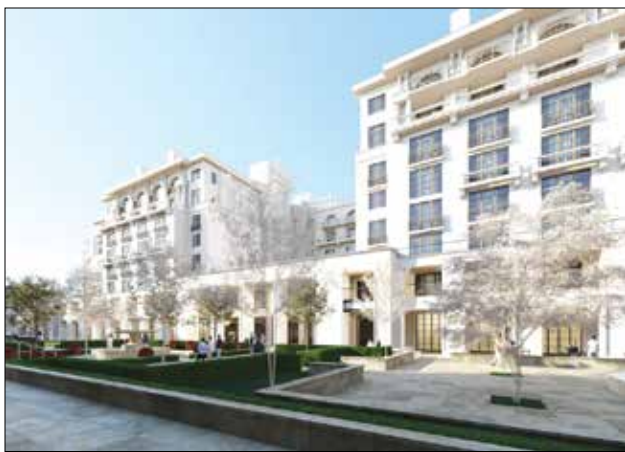
Rendering of modifications to 225 North Canon Drive

an existing deck that will be surfaced with stone/tile pavers, installing a new elevator, including a membrane roof and parapet, repainting the building an off-white color, and square openings in the exterior stucco finish, new steel black doors, windows with metal spandrels that will be painted to match the doors, limestone trim, and glass railing that will be installed on Levels 1 and 2.