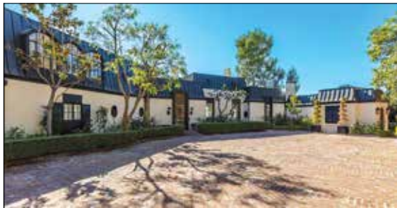
1010 Hillcrest Road

square foot single family home and was designed by John Elgin Woolf in 1959. The property combines elements of English Regency and French architecture.