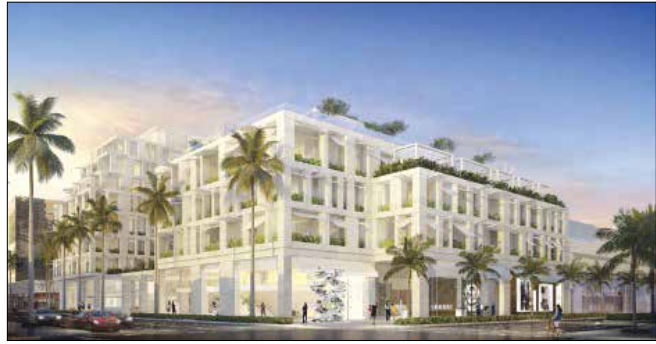
Rendition of Cheval Blanc project

The Draft EIR looked at air quality, biological resources (Bats), cultural resources, energy, geology/soils (paleontological), greenhouse gas emissions, land use and planning, noise, transportation, tribal