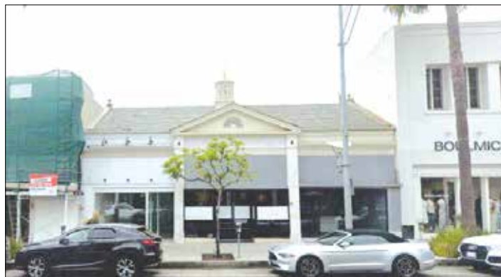
317 North Beverly Drive Project Site

ities that would allow the Planning Commission to approve up to two applications for these facilities through a conditional use permit. The first application was approved for a restaurant use at 250-260 North Cañon Drive; the second application