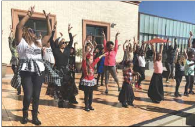
Dance Sunday with Debbie Allen and Friends at The Wallis.

Winter and Spring offerings will include a series of cinema presentations in partnership with Film Independent and The Wallis' Sorting Room, which transforms the Lovelace Studio Theater into an intimate nightclub.