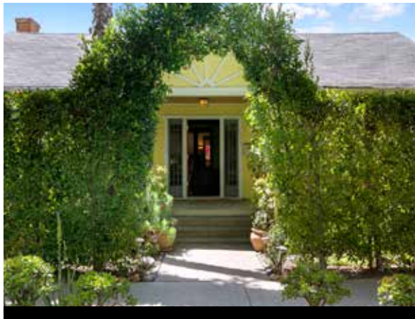
525 Westmount Dr | West Hollywood