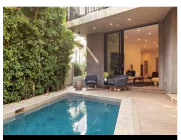
460 N Kings Rd | Beverly Grove