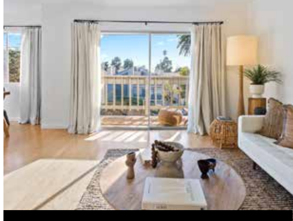
1021 12th St | Santa Monica