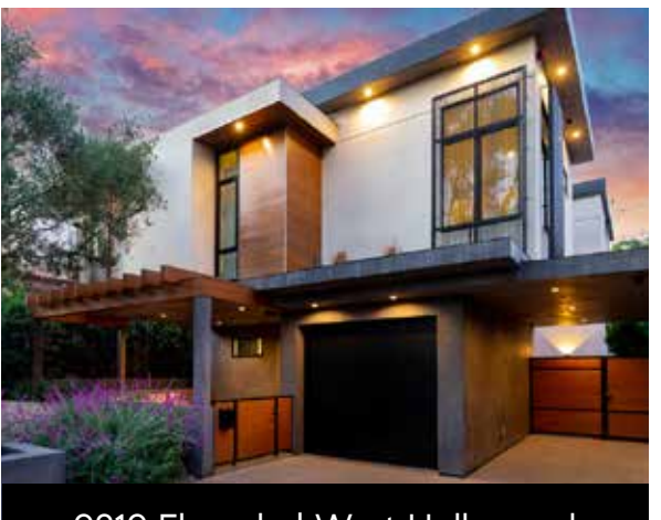
9019 Elevado | West Hollywood