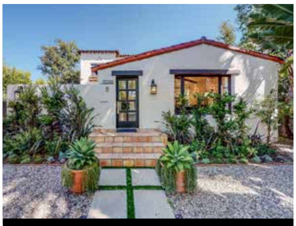
10388 llona Ave | Century City