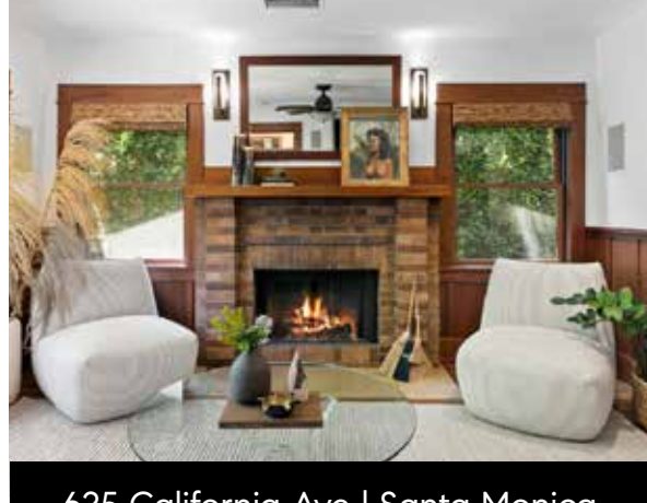
625 California Ave | Santa Monica