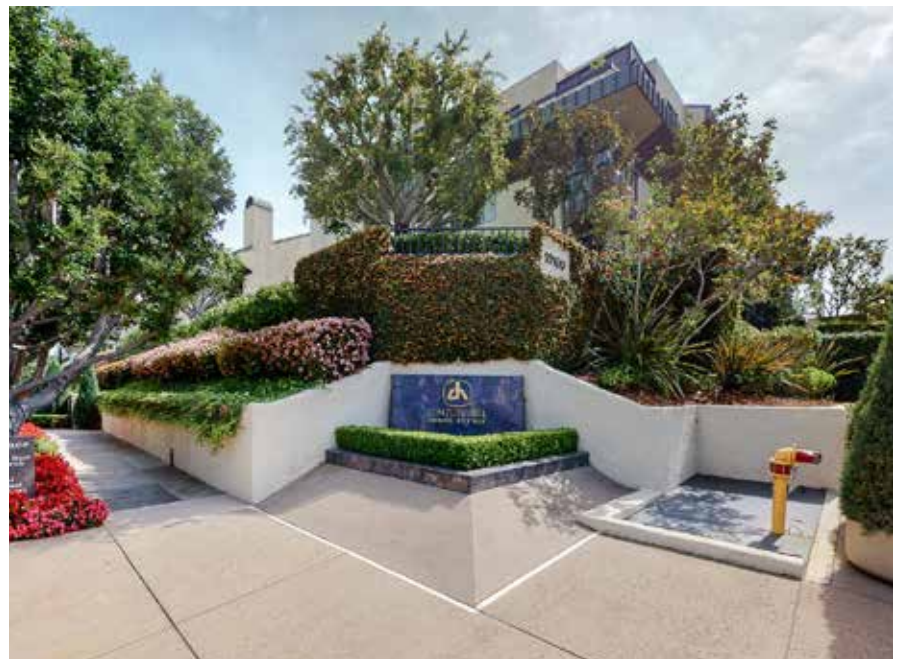
2228 Century Hill | Century City