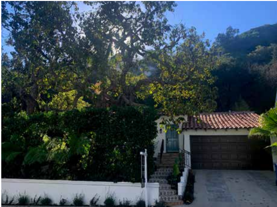
1555 N Beverly Dr | Beverly Hills