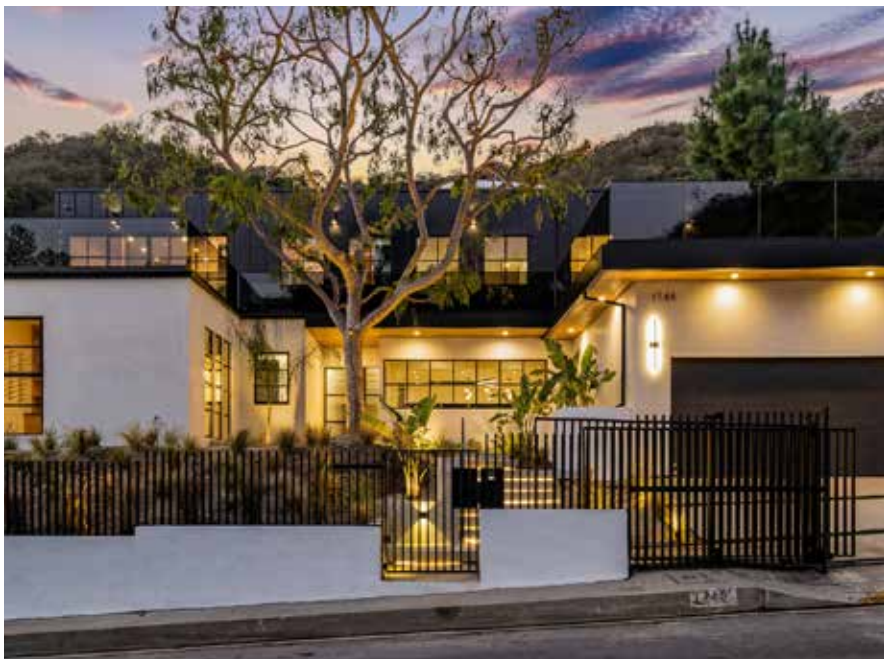
1745 San Ysidro Dr | Beverly Hills