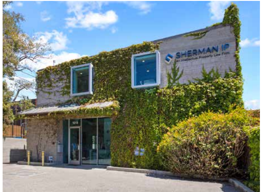
1519 26th St | Santa Monica