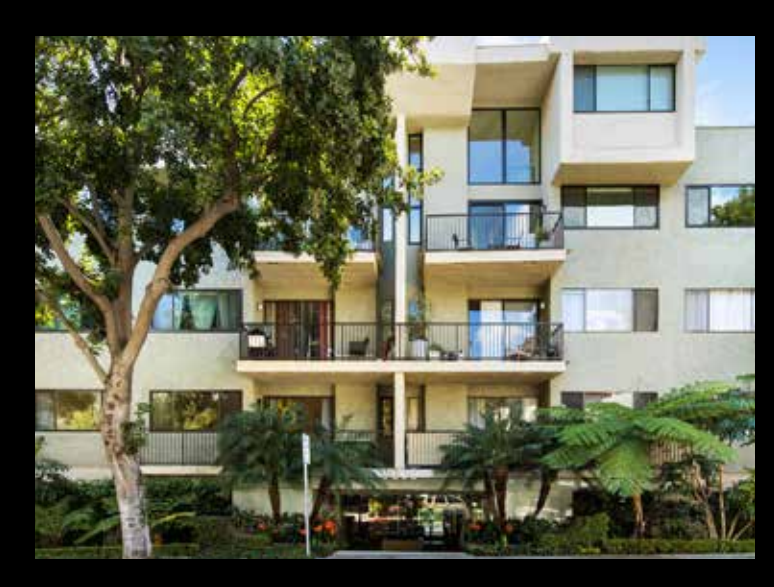
9000 Cynthia #302 | West Hollywood