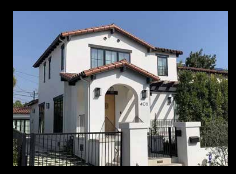
408 Westbourne Dr | West Hollywood