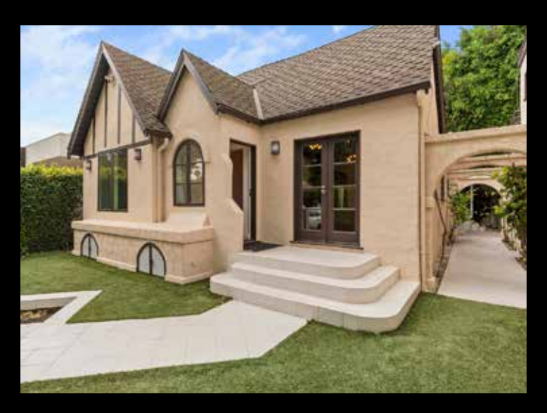
559 Huntley Dr | West Hollywood