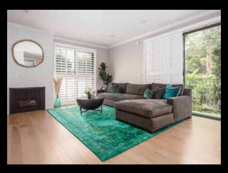
9125 Charleveille #19 | Beverly Hills