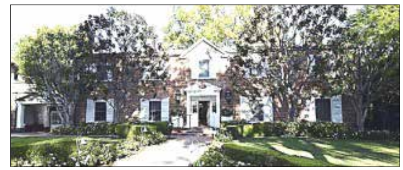
910 North Roxbury

"I just have a lot of difficulty agreeing that this one should be