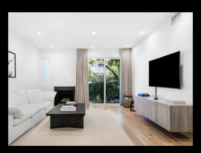
9000 Cynthia #207 | West Hollywood