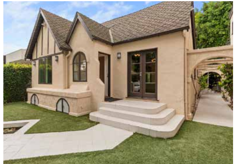
559 Huntley Dr | West Hollywood