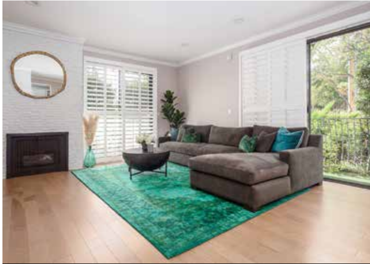
9125 Charleville #19 | Beverly Hills