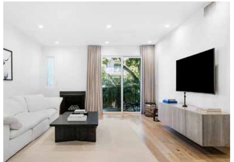
9000 Cynthia #207 | West Hollywood