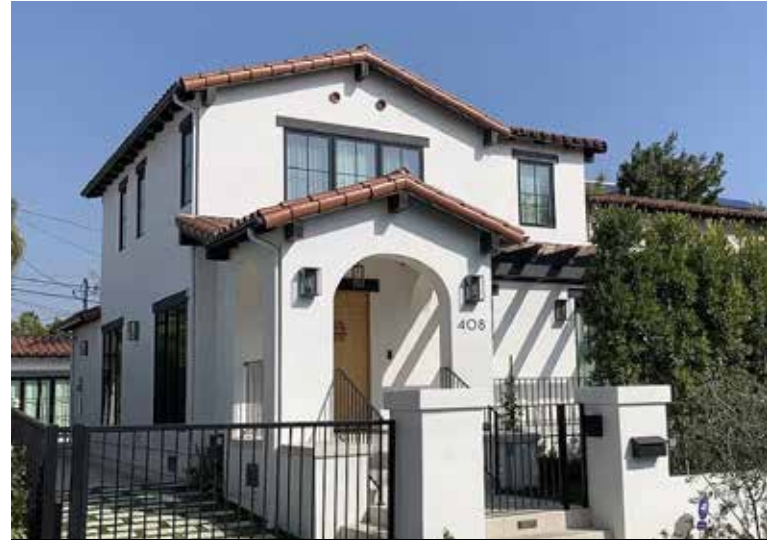
408 Westbourne Dr | West Hollywood