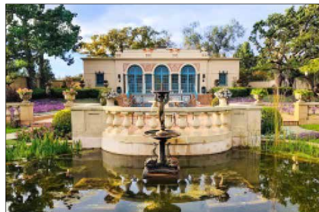
Virginia Robinson Gardens