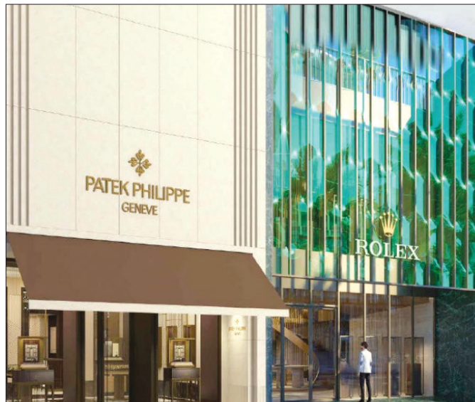
Rendition of Project

The project involves the construction of a new third story addition to an existing commercial building with a new outdoor terrace. The existing commercial building was most recently occupied by Dolce & Gabbana.