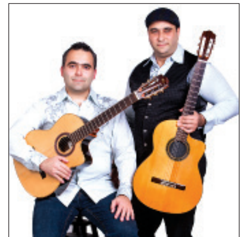
briefs cont. on page 8

Rumba Acoustic will be performing tonight as part of Concert on Canon.