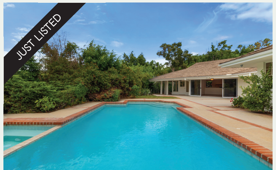
430 Doheny Rd