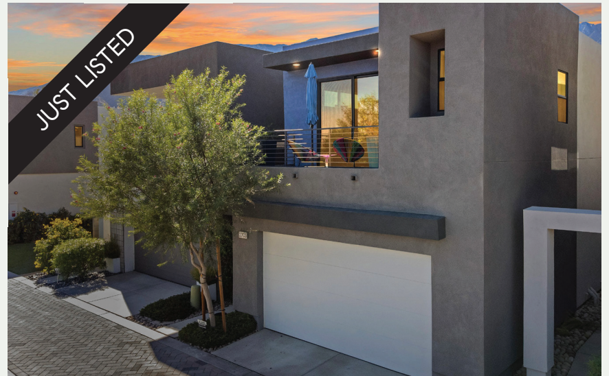
2703 Paragon Loop, Palm Springs