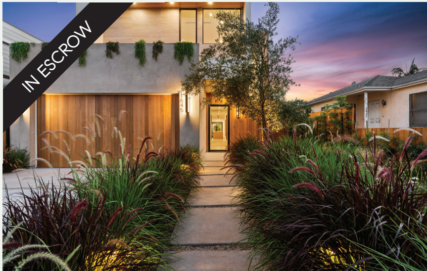
1645 Wellesley Ave, West LA