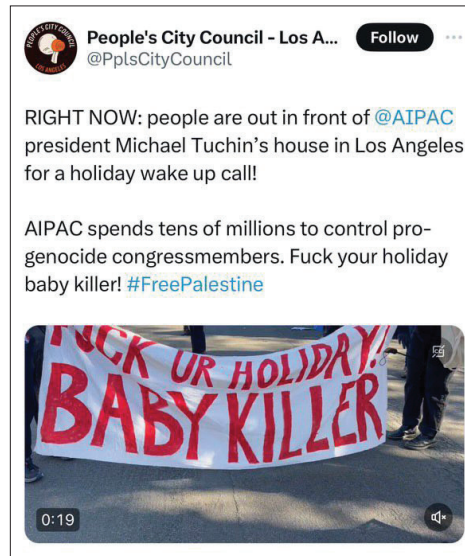
Post on X, formerly known as Twitter

an investigation into a protest that took place on Thanksgiving at the Brentwood home of the president of of the American Israel Public Affairs Committee (AIPAC), with footage showing pro-Palestinian protesters igniting smoke devices in the street and spattering fake blood on the property.