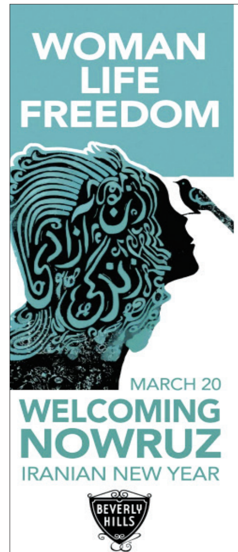
Nowruz Banners From 2023; Date will be updated for 2024

the installation of street pole banners to commemorate the Persian New Year, known as Nowruz (New Day), celebrated this year on March 19, to be placed around the city from March to April 1.