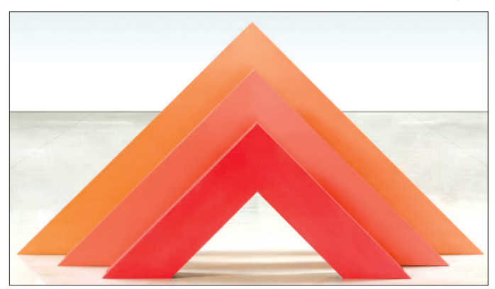
Trinity by Judy Chicago

In Sept. 2022, the City Council revised the medical use regulations, which continued the provisions of an urgency ordinance that had been in place for two years. This was intended to create more flexibility for property owners regarding the use of space in commercially zoned properties during the COVID-19 pandemic when vacancies of commercial spaces were increasing and