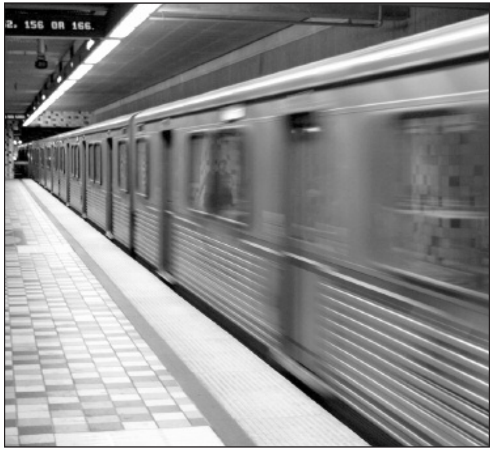
A proposed Westside subway extension could have two stops in Beverly Hills

The first recommendation is the committee's unanimous acknowledgement of the "need and benefits" of a subway extension