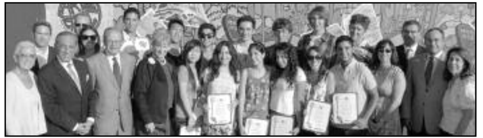
Beverly High Barricade Artwork Unveiling Students from Beverly High unveiled the barricade artwork they designed last week at the Montage Hotel and City Public Gardens construction project. The 36 colorful panels are on display just north of Wilshire along Beverly Drive. The panels depict various Beverly Hills landmarks.