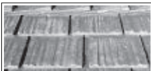
Cal-Shake Shakes are a fiber-cement roofing product made to look like a wood shake or slate tile.

The lawsuit claims that Cal-Shake shakes are defective. It also claims that Class Members should be paid for the damage caused by the shakes. The defendant, Shake Company of California ("Old Cal-Shake"), denies these claims and any wrongdoing.