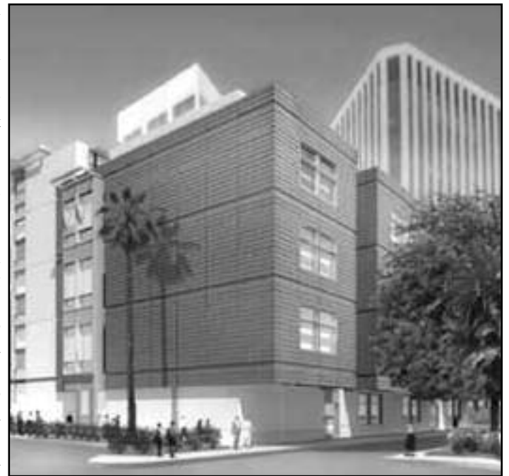
Science and Math Technology Building

The new building at Elm and Charleville houses three brand new kindergarten classrooms, a new band room and music room. Two-new pre-school classes will also be