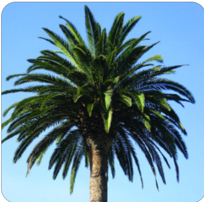
The palm tree images show the difference between a healthy palm tree (left) and one that has not been properly trimmed (right). The healthy palm tree pictured is on Bedford Drive, and the untrimmed palm tree pictured is on the 600 block of North Rexford Drive. The Beverly Hills Fire Department recommends that all trees be trimmed in order to avoid hazardous fires.

“Steep canyons can potentially race up in a time of fire,” said Scranton. “[That’s the reason] why we have an extensive brush clearance program to reduce fuels around peoples homes so that if a fire does happen