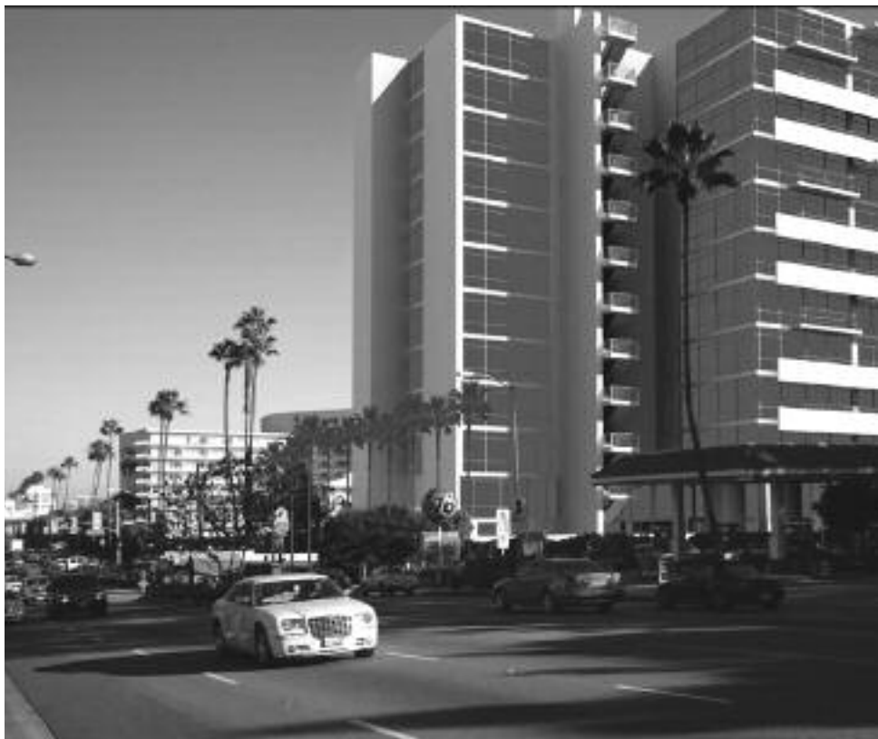
Architect's rendition of the 9900 Wilshire Blvd. project.