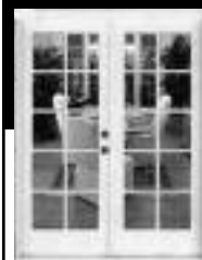
CA. ST. LIC. #697862