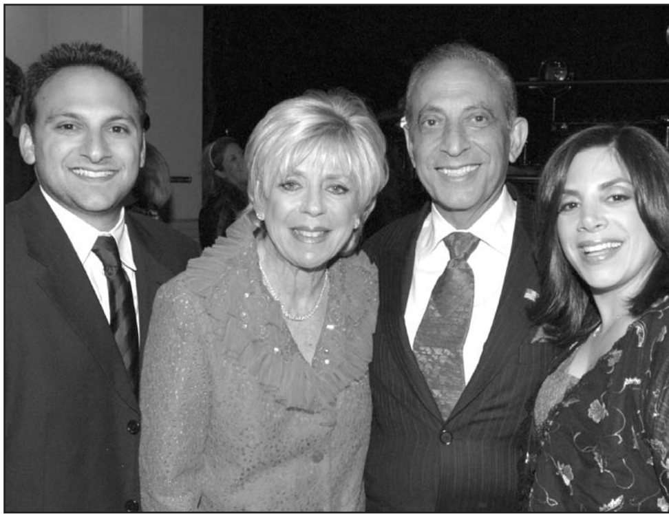
Daniel Delshad, Lonnie Delshad, Mayor Jimmy Delshad and Debra Delshad-Banks.

Mayor sets the agenda and sets the vision for the city. Council members go along or disagree or modify that vision. So as a mayor, those are the agendas that are set for us: to continue being the smartest city, to continue being a green, sustainable city and a friendly city. So the council will go along and hopefully help and modify it, and see how it works and try to put those into play.