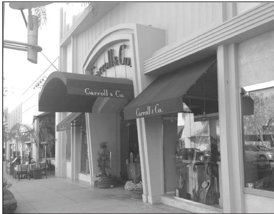
Carroll & Co.