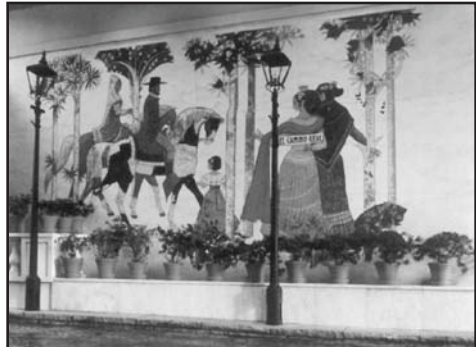
Millard Sheets Mosaic Mural

The City Council gave staff direction on installing the Millard Sheets Mosaic Mural over the Civic Center Parking structure at the study session on Tuesday.