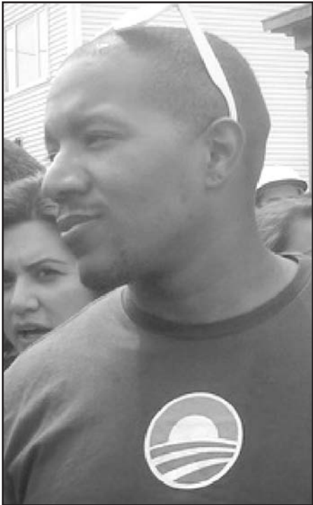
The 1991 Beverly High graduate talks about leading grassroots efforts as Wisconsin Operation Vote Director for the Obama campaign