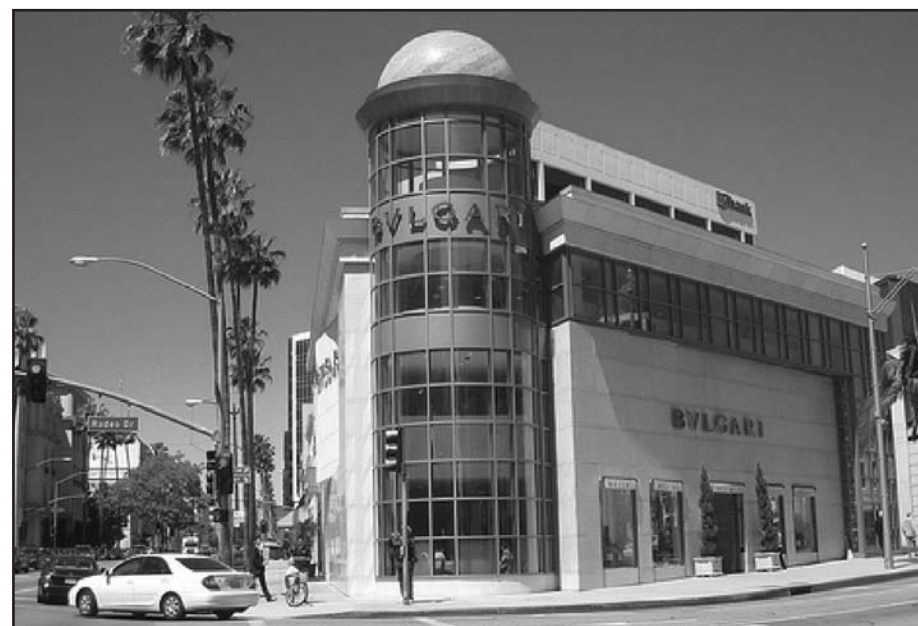
The Derby located on the corner of Rodeo Drive and Wilshire Boulevard