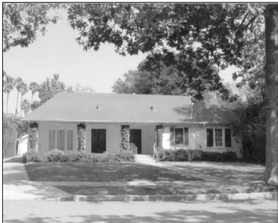
724 N. Camden Drive

I'm really proud to be part of an organization that provides service to others and promotes integrity and advance world understanding and good will through our business and professional community leaders.