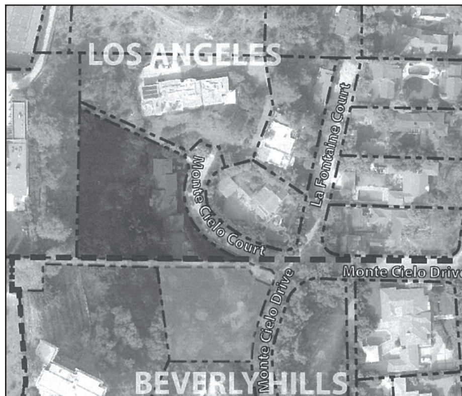
Top shaded area is located in Los Angeles, bottom shaded area is located in Beverly Hills, and the middle shaded area is the 10-foot wide strip of land that belongs to the City of Beverly Hills

Aside from using Beverly Hills utilities, the Landers and any other subsequent property owner will not be able to have any privileges allowed for Beverly Hills residents, such as voting in Beverly Hills' elections or attending any schools within the BHUSD. Should the property owners partake in any of those privileges, the approval for the variance will be voided and the structure will be demolished, according to the new conditions to allow the construction of the pool house.