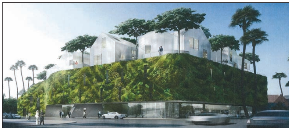
8600 Wilshire view of commercial and residential space