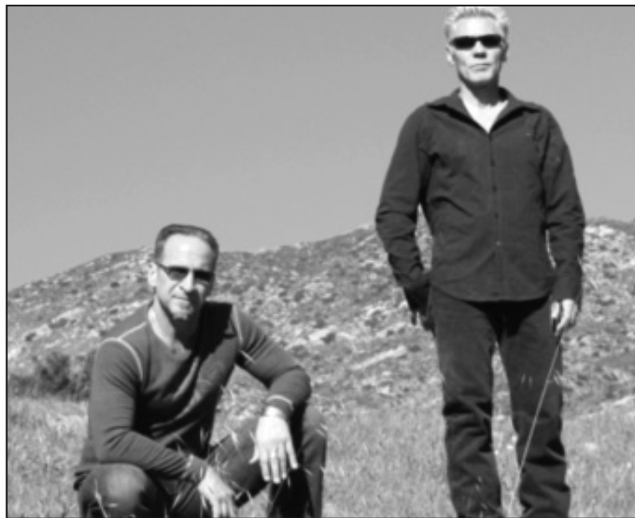
Dakota to perform on August 7