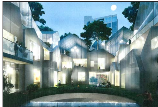
8600 Wilshire courtyard view

“It’s going to be one heck of a maintenance project,” Apatow said.