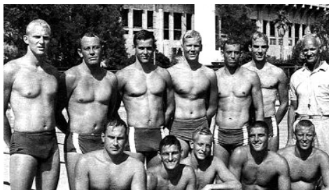
1964 U.S.A. Water Polo team