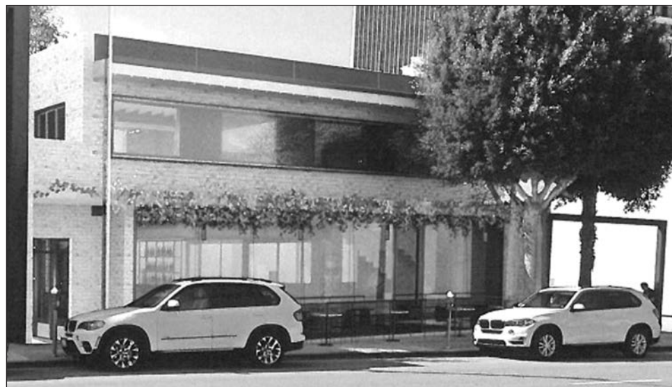
9960 South Santa Monica Boulevard