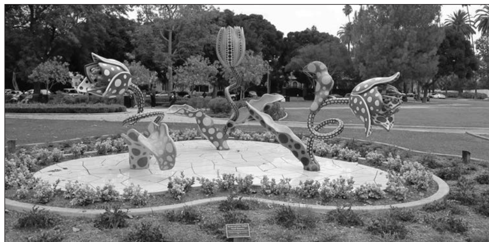
Yayoi Kusama’s Hymn of Life: Tulips sculpture at Beverly Gardens Park, pre-fence.