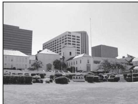
Beverly High's iconic front lawn

The UCLA Department of Political Science will host a discussion between retired Congressman Henry Waxman (D-Los Angeles) and UCLA Political Science