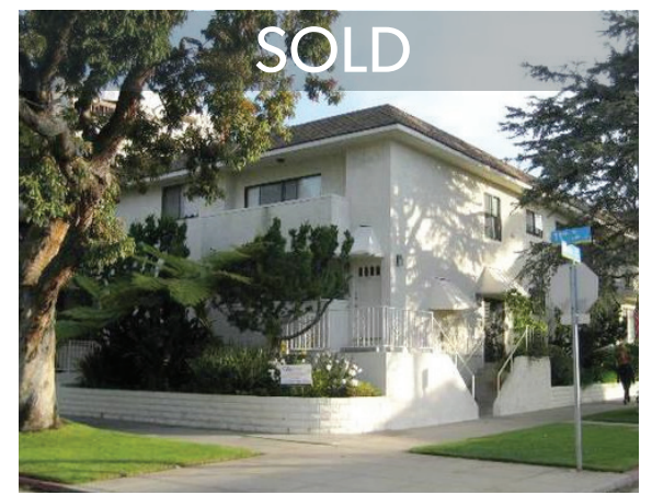
1105 Idaho Ave. #208 | Santa Monica On the market 214 days with previous brokers!