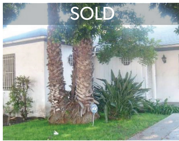
316 N. Crescent Heights | Beverly Center On the market 859 days with previous brokers!