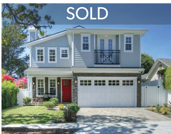
639 N. Sierra Bonita Ave | West Hollywood On the market 271 days with previous broker!

Hawthorne Graduate & Beverly Hills High School Alumna