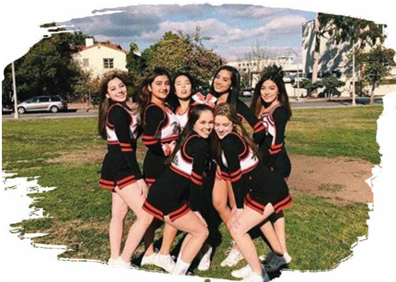
DEJA VU MORENO DRIVE