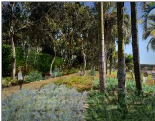
Beverly Gardens Park Rendering

In addition, intermittent blocks between Doheny Drive and Arden Drive will be closed to allow for construction, beginning with the block from Alpine Drive to Foothill Road, and four blocks between Arden Drive and Doheny Drive.