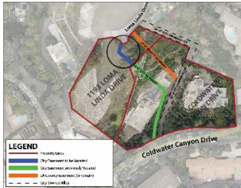
1184 & 1183 Loma Linda Drive

But others said it is “reasonable” for residents to have the last word.