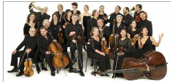
Zurich Chamber Orchestra

This season, Preludes @ The Wallis returns to enhance the audience experience, providing a free pre-concert conversation with artists and special guests one hour prior to each Music @ The Wallis