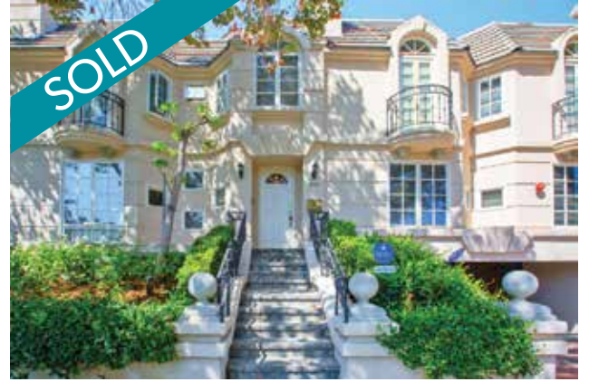
309 Almont | Beverly Hills Listed at $1,249,000 | Sold for $1,425,000