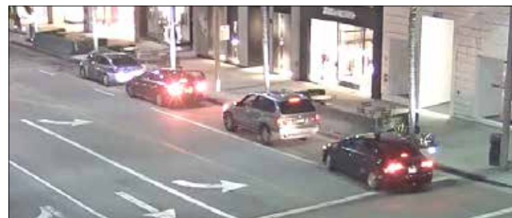
469 N. Rodeo Drive

The pursuit terminated in the area of Cloverdale Avenue and Rodeo Road in the City of Los Angeles, when the driver abruptly stopped, and all passengers (four to six males) exited the vehicle and fled on foot. None of the suspects were apprehended. The suspect vehicle was recovered by police. Several items of stolen