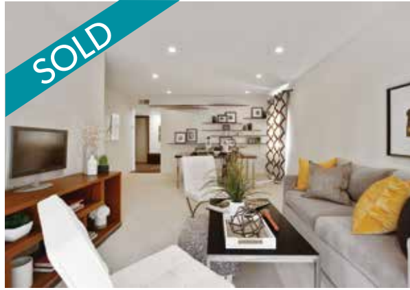
6728 Hillpark | Hollywood Hills Listed at $459,000 | Sold for $495,000 On the market 129 days with previous broker