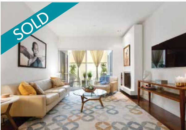
6735 Yucca Street #207 | Hollywood Listed at $695,000 | Sold For 705,000 On the market for 58 days with previous agent