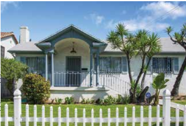
6215 Drexel | Beverly Center