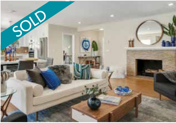
12420 Albers | Valley Village Listed at $998,000 | Sold for $1,051,000 On the market for 5 months with previous broker