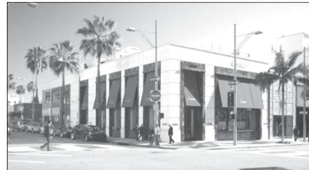
370 North Rodeo Drive

On August 9, the Beverly Hills Planning Commission unanimously adopted a reso-