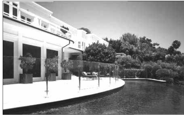
Current 1115 Calle Vista Drive property