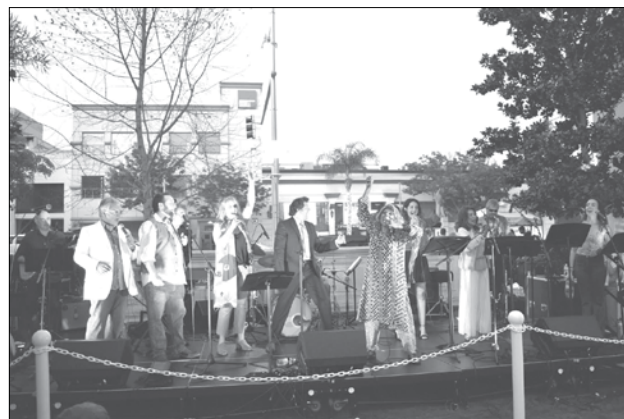
Stephen Wise Band