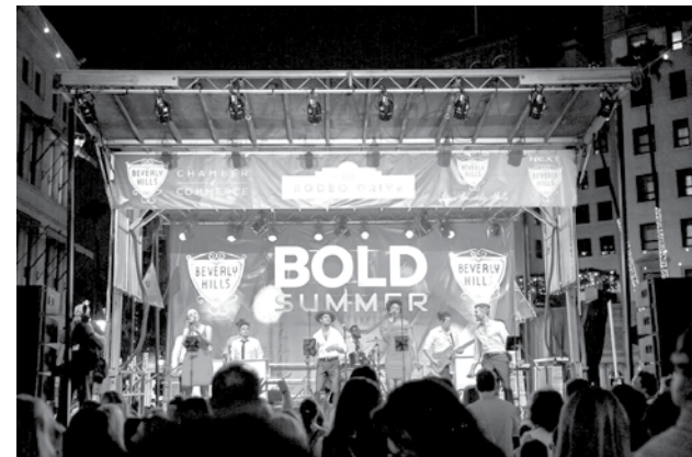
Bold summer kickoff party