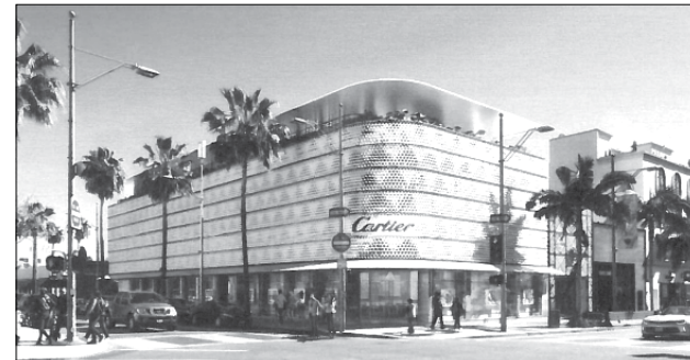
Proposed building rendering

lution conditionally approving a development plan review and in lieu parking to allow the construction of a new three-story commercial building for Cartier at 370