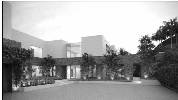
1115 Calle Vista Drive Rendering

name would have anything to do with it.”