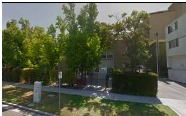
West Coast Torah Center

The parking level would be constructed as a fully automated facility with the ability to accommodate 25-29 cars and would