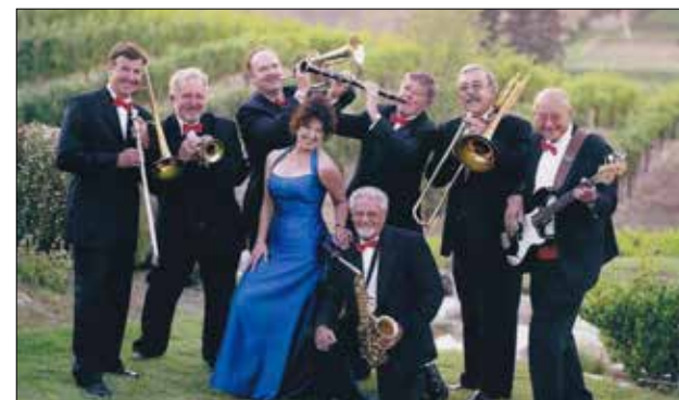
Hotsy Totsy Boys