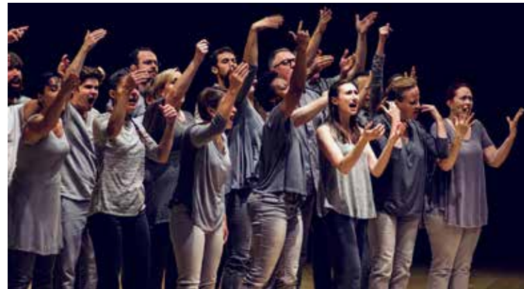
Los Angeles Master Chorale