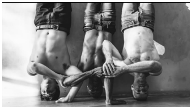
Jacob Jonas The Company