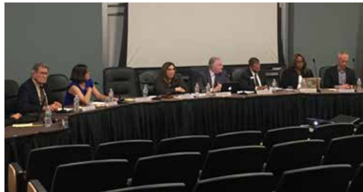
Beverly Hills Board of Education at August 28 meeting

"This year alone I'll pay $10,000 out of