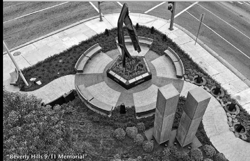
"Beverly Hills 9/11 Memorial"