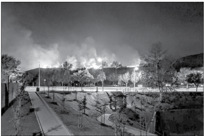
Fire behind Juan Bautista de Anza Park in Calabasas