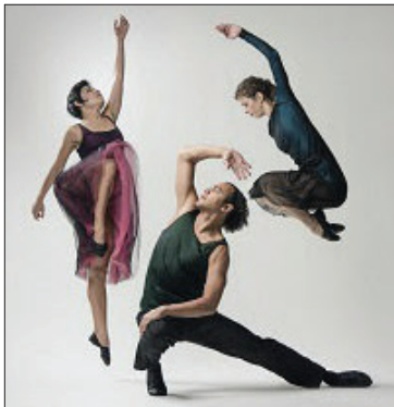
Malpaso Dance Company

Malpaso Dance Company, one of Cuba's hottest contemporary dance ensembles, will bring a slice of Havana to Southern California with three performances on Thursday, March 28 through Saturday, March 30 in The Wallis Annenberg Center for the Performing Arts' Bram Goldsmith Theater. The shows will begin at 7:30 p.m.