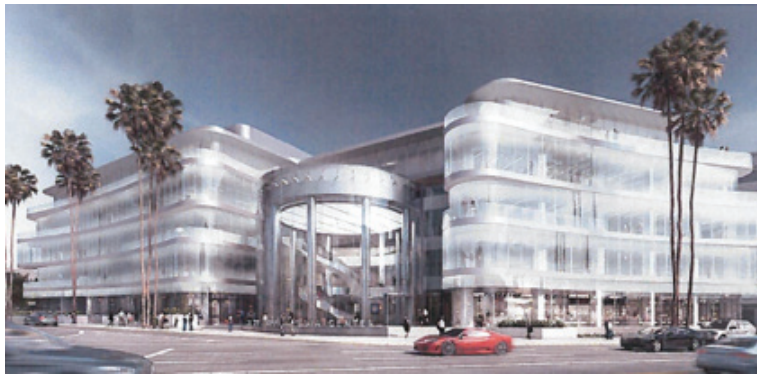
Rendering of Beverly Hills Media Center project from the intersection of Wilshire and Crescent

“All of the incentives that are built into this, all of the additional height and the additional stuff, are things that will inevitably physically impact the environment.