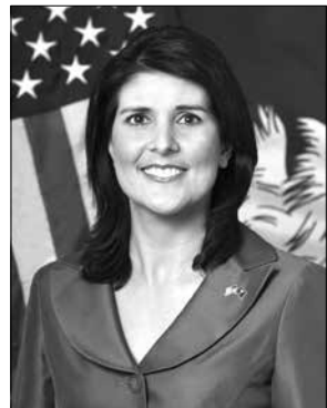
Ambassador Nikki Haley