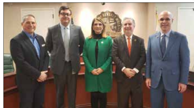
Beverly Hills Traffic & Parking Commission

Other potential options included turn restrictions, traffic circles, and "speed