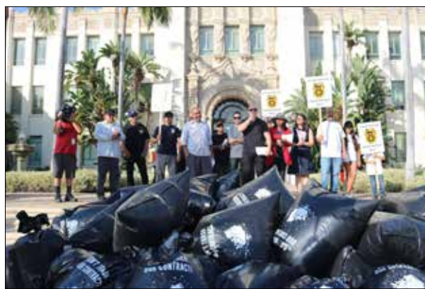
Athens Sanitation Workers Protest on City Hall