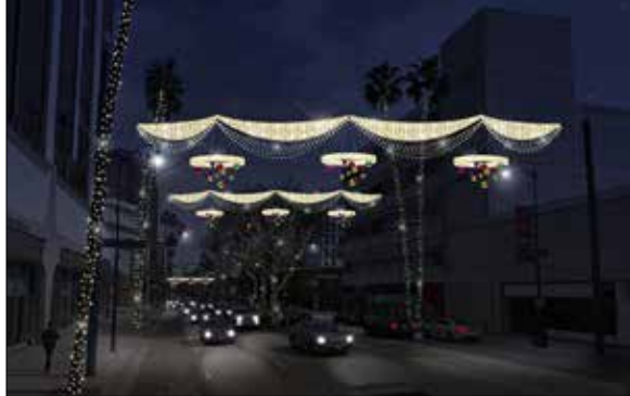
Approved Wilshire Boulevard Spans

BOLD Holidays “Jolly Trolley” will be a reoccurring activity from last year’s