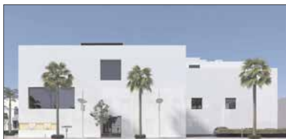
Proposed facade for Chanel building

The building is located at 400 North Rodeo Drive, the northeast corner of Rodeo Drive and Brighton Way. The project also requires approval of a sign accommodation for multiple business identification signs and to allow a sign to be located on a wall abutting an alley.