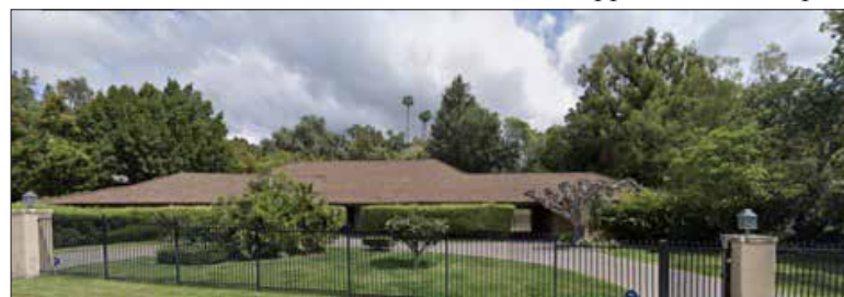
1006 Pamela Drive

mit for the construction of a new home on Pamela Drive in 2017, which was required to commence before it expired on February 10. In order to extend the permit on the day it was set to expire, the homeowner excavated two holes on the property to qualify as construction.