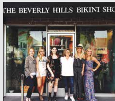
The Beverly Hills Bikini Shop

She said she had to furlough all of her employees.