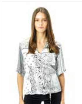
Bandana Reconstructed Wrap Shirt, sold by Amiri.