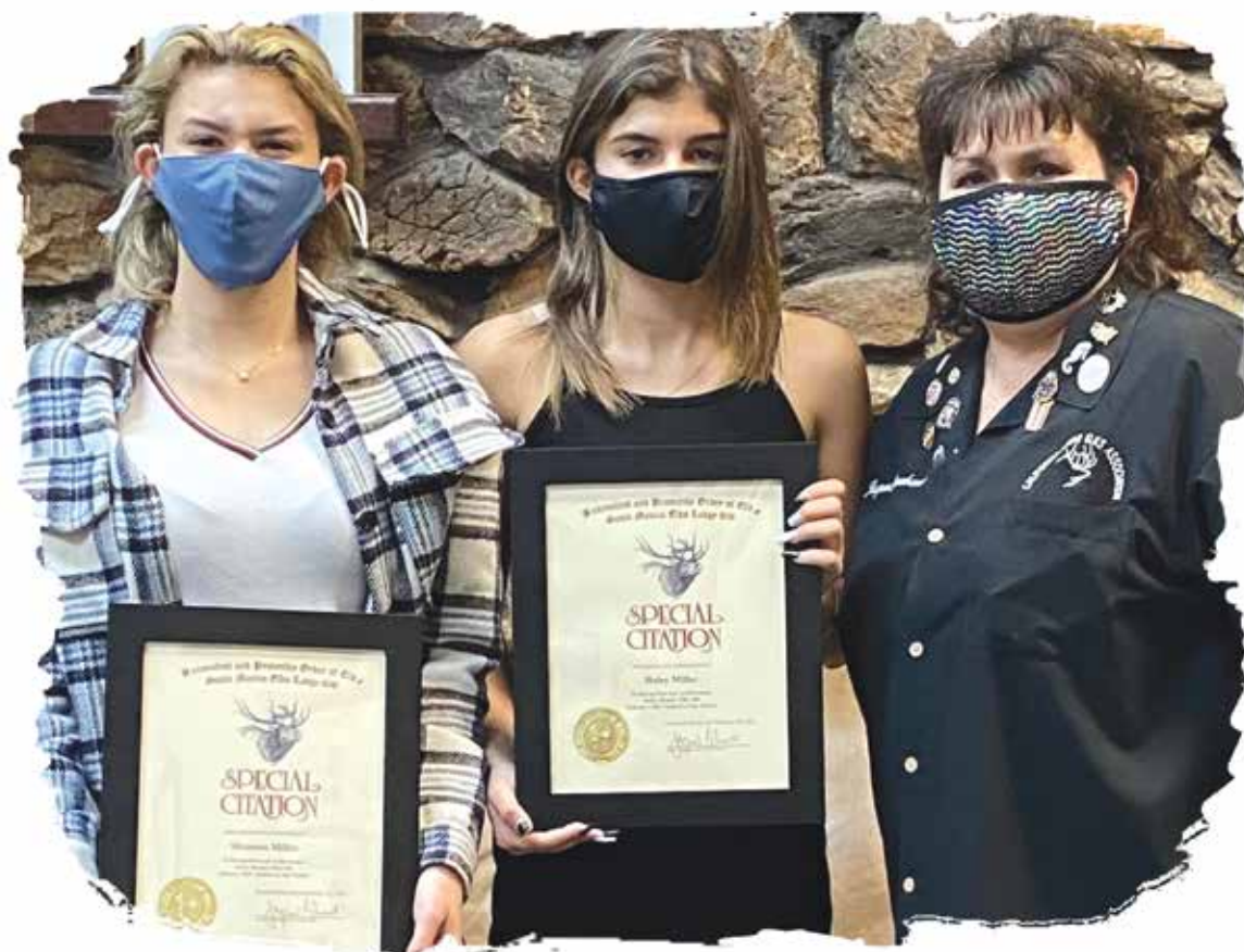
STELLAR STUDENTS SANTA MONICA