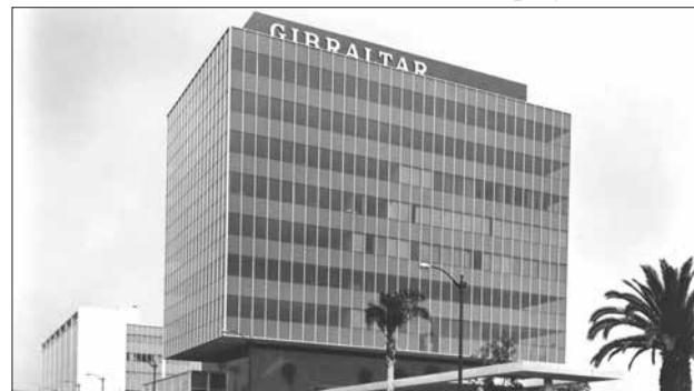
The Gibraltar Square Office Tower in 1958

"I do agree that the one-year time frame is completely untenable and if we allow three years for a single-family home, I can't possibly understand why hotels allow for only one year," she said. "I know that's some sort of glitch in the system that should be corrected."