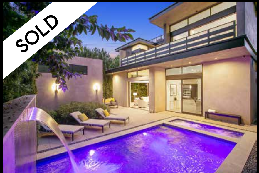
9021 Rangely Avenue | West Hollywood Sold for $4,000,000 Represented Seller