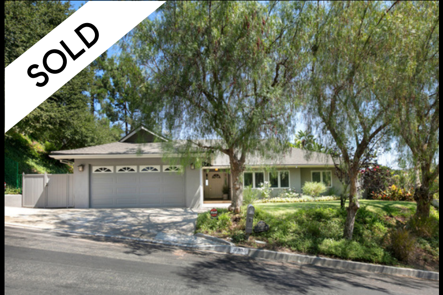
10935 Alta View | Studio City Sold for $1,900,000 Represented Buyer and got offer accepted the first day.