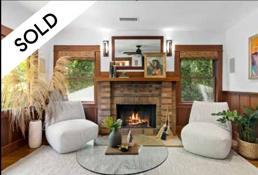
625 California Avenue | Santa Monica Sold for $2,675,000 Was previously listed with 2 other agents.