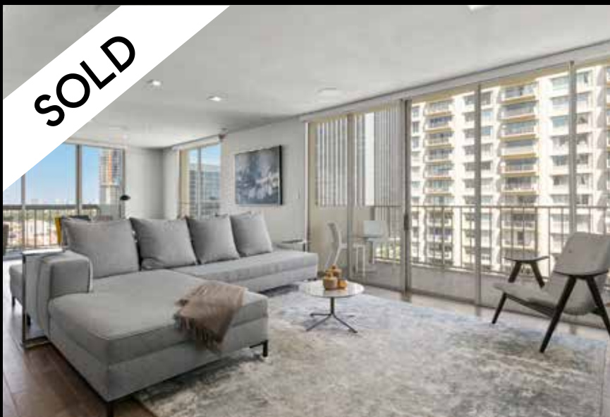
2170 Century Park East #1406 Sold for $1,300,000 Represented Seller, record breaking sale.