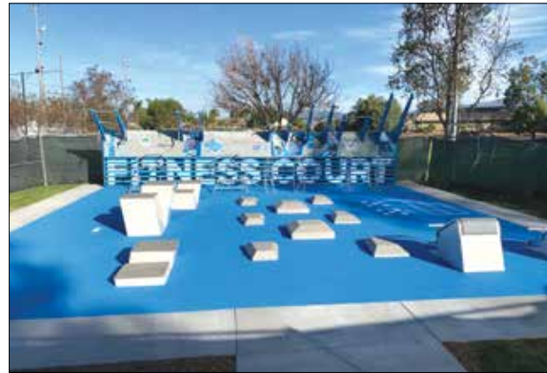
Rendition of Court

At their Tuesday meeting, the Recreation and Parks Commission unanimously approved to move forward and consider the implementation of a new Outdoor Fitness Court Program. Representatives from the National Fitness Campaign pro-