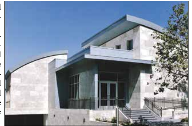
First Church of Christ Scientist

To provide an additional 15-20 parking spaces for staff parking for Beverly Vista Middle School employees BHUSD has