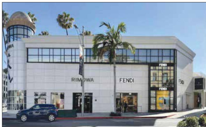
Rendering of 201 North Rodeo Drive

According to the Aug. 18 staff report, the total square footage of all six signs equals 42.54 square feet, which is lower than the maximum area of 130 square