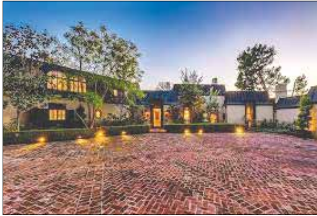
1010 Hillcrest Road