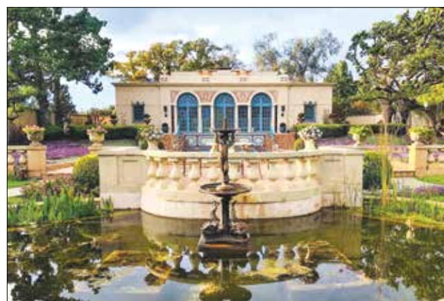
Virginia Robinson Gardens

In 1980 the County Board of Supervisors certified an Environmental Impact Report (EIR). This included provisions to limit hours of operation and number of