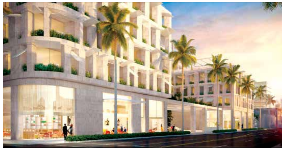
Rendition of Cheval Blanc project.