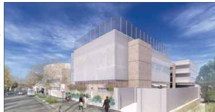
Proposed Hillel Gym and Classroom Building

Commission discussed a proposed project involving the renovation and expansion of Harkham Hillel Hebrew Academy, located at 9120 Olympic Boulevard.