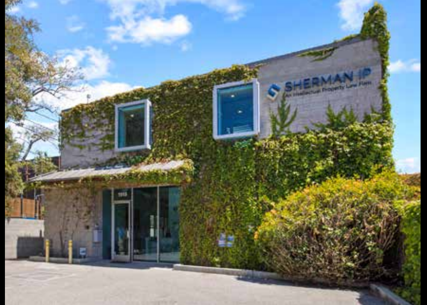
1519 26th St | Santa Monica