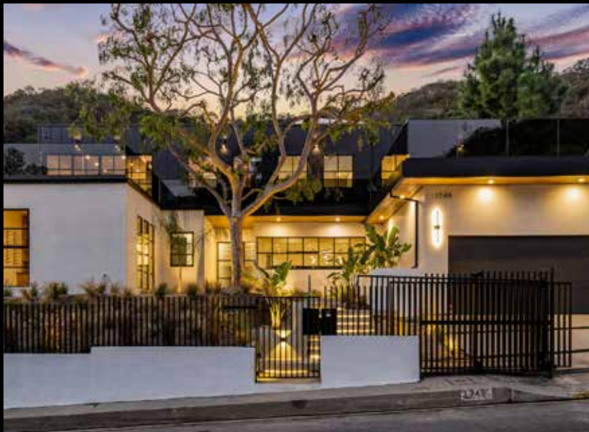
1745 San Ysidro Dr | Beverly Hills