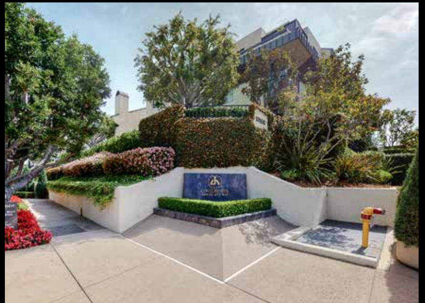
2228 Century Hill | Century City