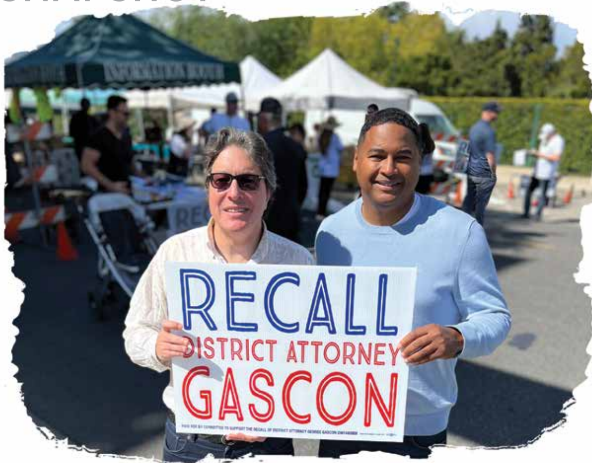
GASCON'S GOTTA GO CIVIC CENTER DRIVE