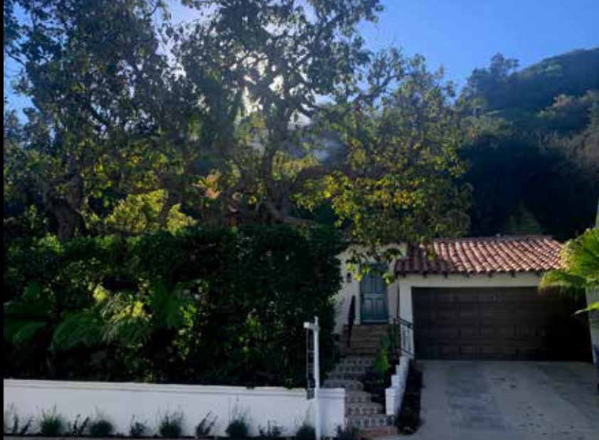
1555 N Beverly Dr | Beverly Hills